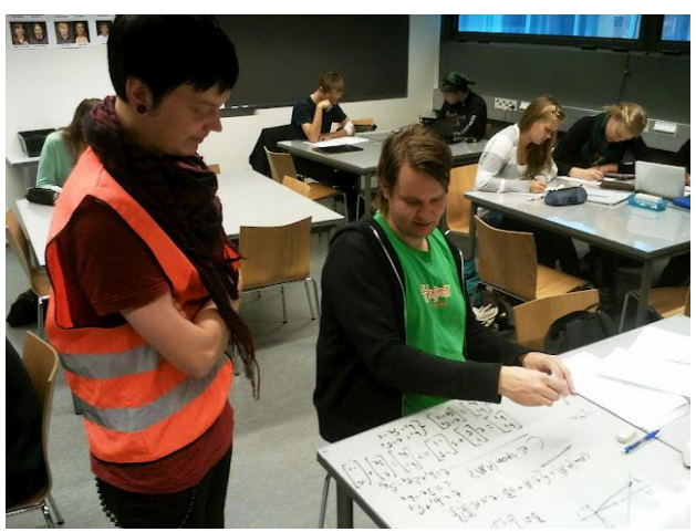
Figure 1. The instructor (in an orange vest) discusses the solution with a student in the XA classroom. [Published with permission from participants.]

The idea of the XA is to offer students individual instruction that is easily available. It has been noted that students are reluctant to ask for help even if it is offered. A number of measures were taken in order to make the students feel that they were expected to ask for instruction. The instructors wore orange vests with the print "Instructor". Also, their names and photographs were posted on the wall. Students entering the classroom should not need to think twice whether they were allowed to ask for instruction. A typical scene from the XA classroom can be seen in Figure 1.